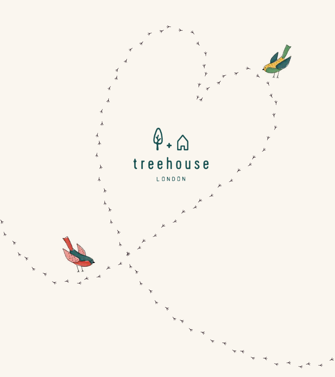
14-15 Langham Place, London W1B 2QS