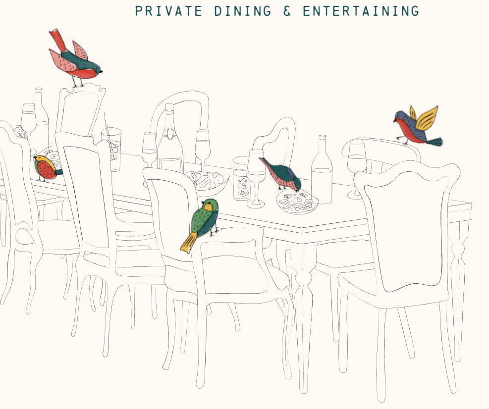
14-15 Langham Place, London W1B 2QS